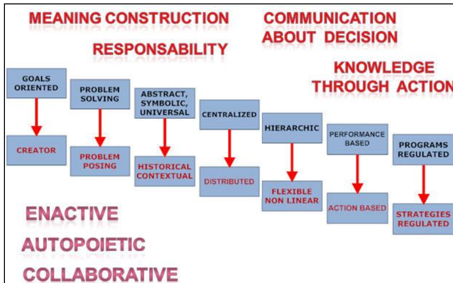
Fig. 2: PENTHA Model learning key factors

According to the above explanations, we assume that students build their own knowledge ( constructivist approach ) on the basis of what they already know, realizing what they are doing and for what objective ( problem posing ) [Lijnse and Klaassen, 2004]. The lesson modes that activate these processes are: heuristic lesson , which allows the capability of dialogue and problem posing; individual- or guided problem solving ; brainstorming , for comparison, creativity and collective problem posing; social discussion , for the problem posing and comparison of opinions and perspectives. Additionally, the following modes are significant: cooperation /collaboration , for mutual support and sharing of resources; simulation of role playing or phenomena , for the exploration of rules; project work , for adductive activity.